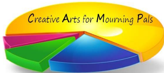
An arts program for grieving children