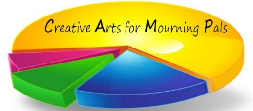
Creative Arts for Mourning Pals